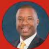
Morey Wright, Jr. District 2 Commissioner